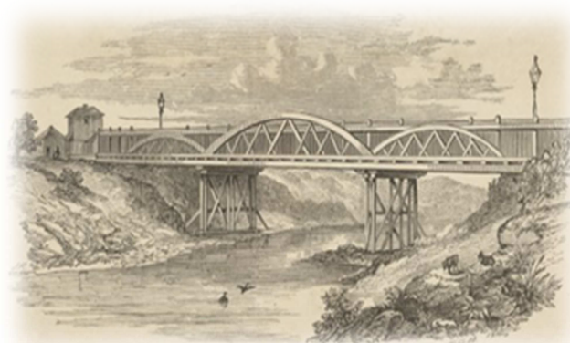
Victoria Bridge Spanning Wallis Creek, Maitland

We will resume on Saturday 5 th January 2013