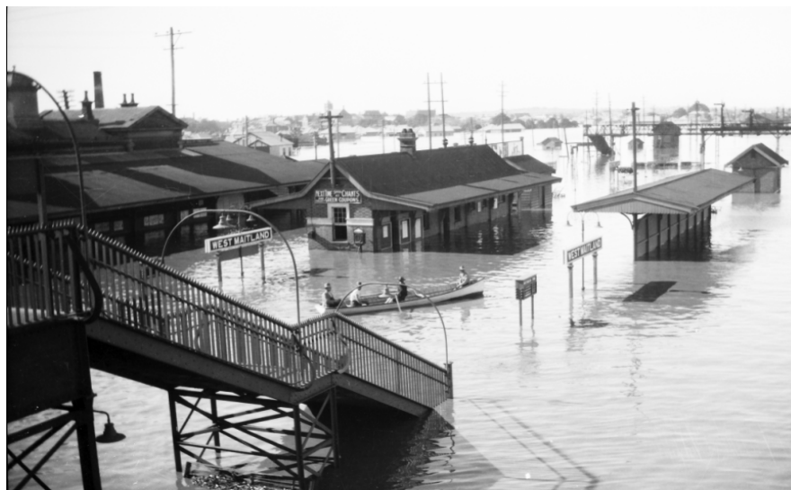
The 1880 West Maitland Railway Station at flood time.

The station building was made of brick with stone dressing on eighteen inch deep concrete foundations in the classical style of architecture. Special attention was paid to the comfort of the ladies by providing a special waiting room with access to refreshments and private access to the platform. In addition, there was a general waiting room, gentlemen's refreshment room, booking office, ticket office, parcel's office, a porters' room, telegraph office, and a station master's room. The flooring was made of 1.25 inch Oregon pine slabs, with the counters and other woodwork made of cedar. The brickwork was tuck pointed and the main portion of the roof of the building was covered with slate. The sandstone used was from the local Ravensfield quarry. The building supervisor was Mr H.J. Chinner and 22 men were employed in the construction.