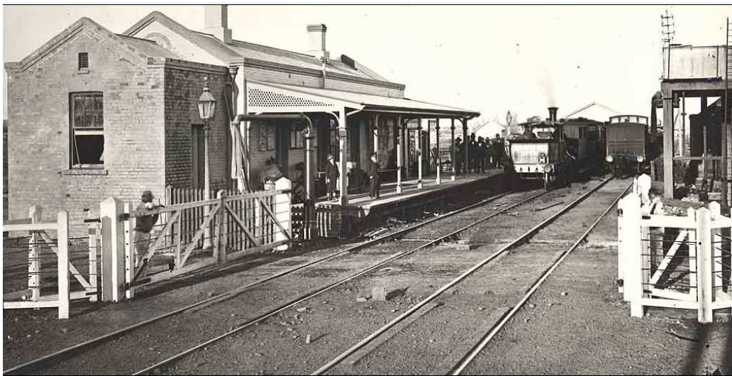
The 1858 West Maitland Railway Station, photographed in 1877

This first West Maitland station was a simple single storey brick building located at the bottom of Elgin Street.