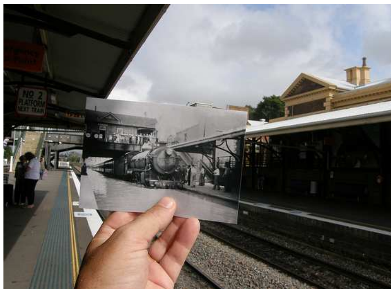
Maitland Railway Station looked more like a canal as this unknown 36 class locomotive pulls into number 1 platform during floodtime. The building on the bridge above the train is no longer there.

More of Peter’s “Now and Then” photographs can be viewed online via Flickr at the ABC Open Hunter's photostream http://www.flickr.com/photos/53349403@N07/