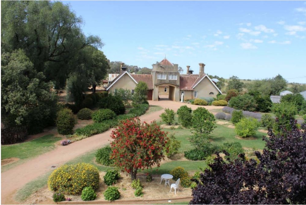
landra stables and machinery shed with electric light generator and batteries for the old 110V DC supply