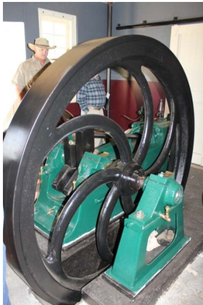
8 inch single cylinder Crossley Bros, gas engine. 2m flywheel approx 2 tonne