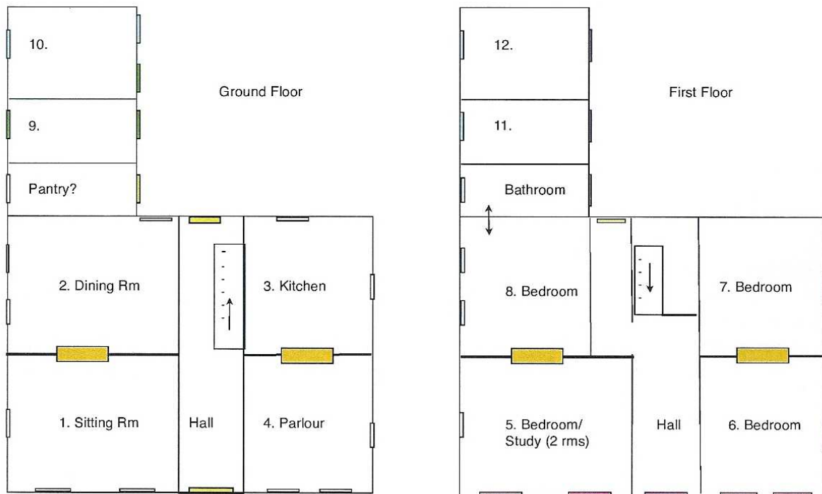
Rough layout of The Hermitage not to scale:

Interior doors, verandahs and balconies not shown.