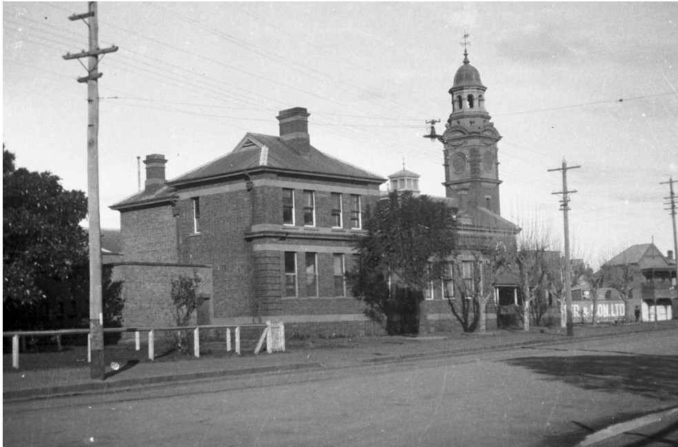
Courthouse 1930s.

reached. This room, which overlooks Sempill street, is 18ft by 14ft, , fitted with gas, fire place, and grate. It contains a strong room, the floor of which is tiled over concrete, the walls have iron shelves, and the room closes with one of Milner's patent strong-room doors. Opposite this is the Charge Room, 25ft. by 15ft. It is provided with a counter the full width of the room, fireplace, and a charge dock in one corner is surrounded by an iron railing. Next is the corridor leading to the cells.