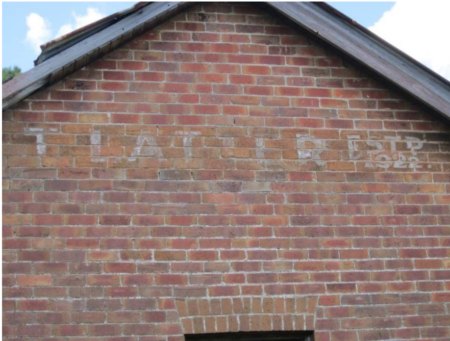
Gillies St., Rutherford

To launch this series, we are featuring a building at Gillies Street, Rutherford, as well as a High Street building.