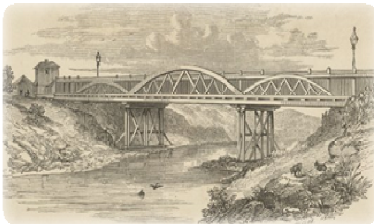
Victoria Bridge Spanning Wallis Creek, Maitland

Linking East and West Maitland (1852-1896)