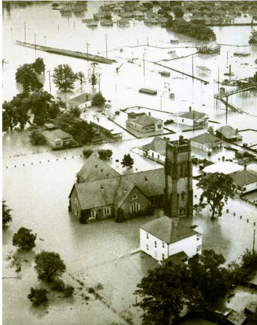
Flood at St Pauls Anglican Church, Maitland, NSW, 1955

After the foundation stone being laid in 1856, floods in 1857 resulted in the foundation stone being completely submerged and since that time has never been located. "Common theory is that it was buried deep under sand and concrete which was employed to raise the foundations two feet. Whilst there is no evidence to prove exactly where the stone lies, it is most likely to be located somewhere under the East window, inside the Church and under the tiles of the Sanctuary." [Marilyn Foster]