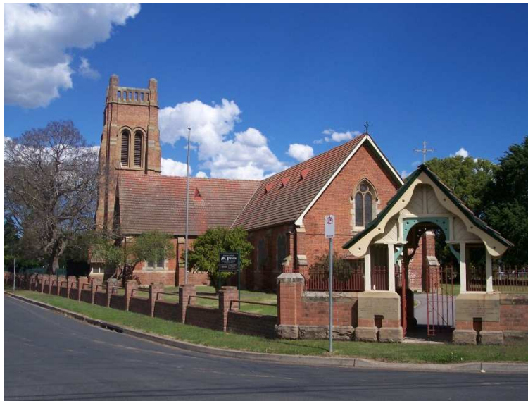
St. Paul's Anglican Church, West Maitland

Affiliated with Royal Australian Historical Society and Museum and Galleries Hunter Chapter