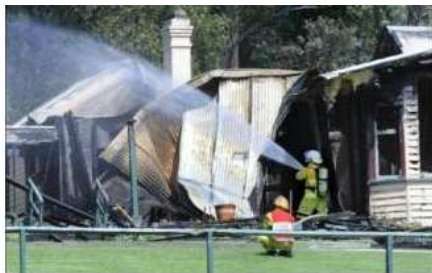
Fire crews at Alison Homestead which was burned down by an Arsonist overnight.

The Express-Advocate News of 3 December 2011 reported: