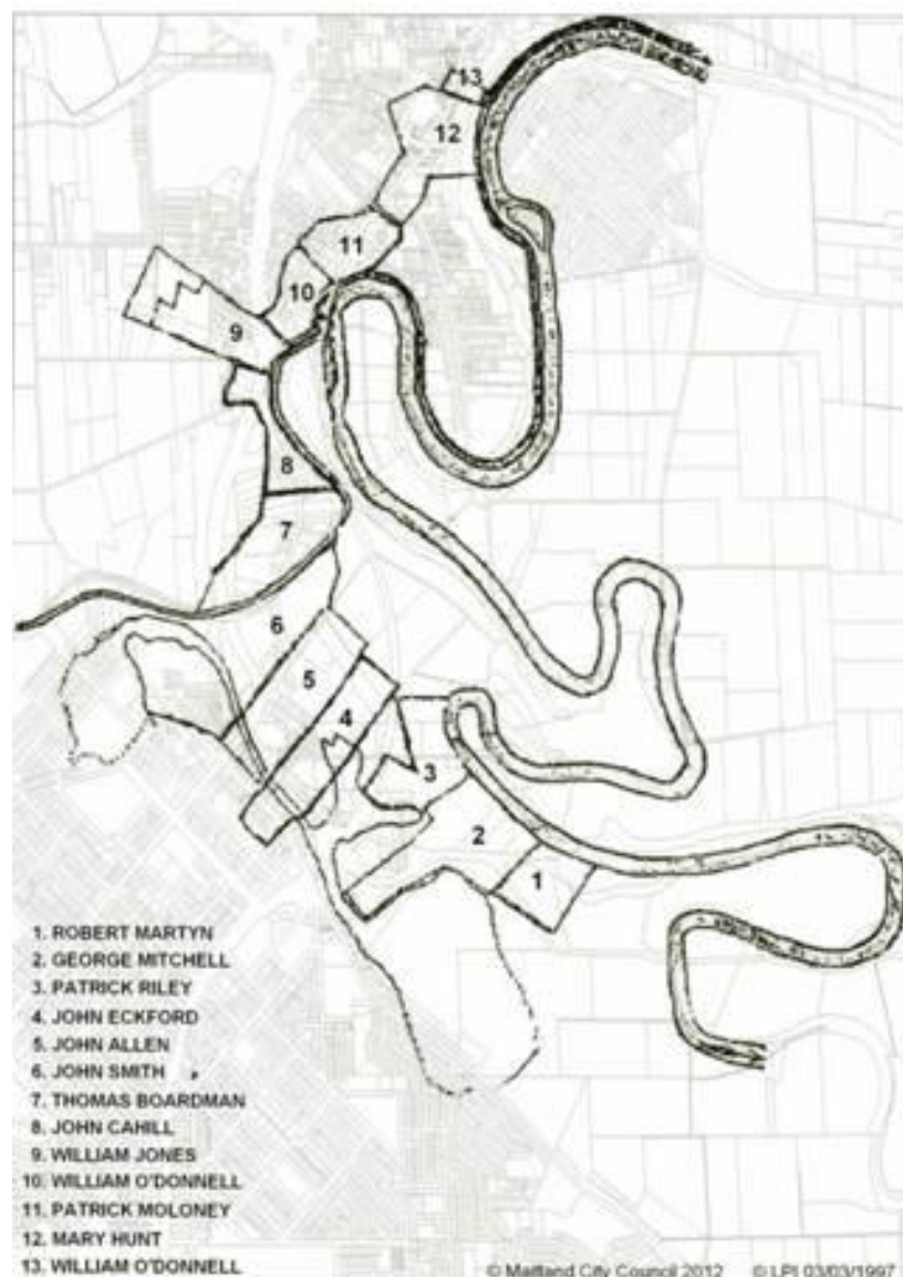
Figure 3: The holdings of Wallis Plains as surveyed in 1823, superimposed on the modern street layout. Note that the original holdings were never surveyed and had no official boundaries; their precise locations are unknown but at least one of the first settlers (Molly Morgan) farmed a holding on Horseshoe Bend from 1819. That holding was 'resumed' by the government to allow the port to develop in the Horseshoe Bend meander and Morgan was given another, larger plot straddling what became High St between about Hunter St and just south of Elgin St. Its western boundary was about 400 metres south of the site of today's Belmore Bridge.