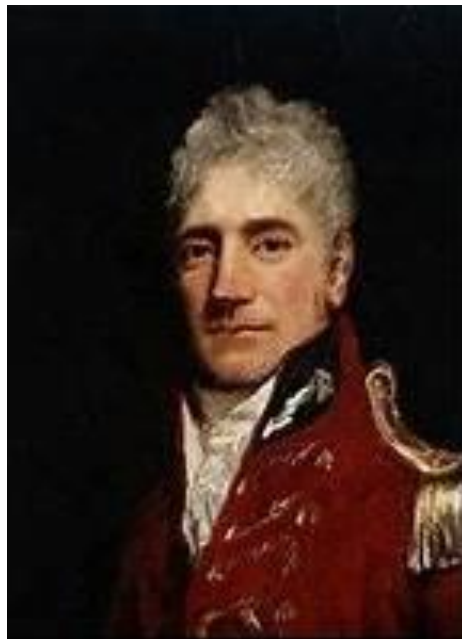
Figure 1: Lachlan Macquarie

Turner, J (1989) The Rise of High Street, Maitland: a Pictorial History , 2nd edition, Maitland, The Council of the City of Maitland