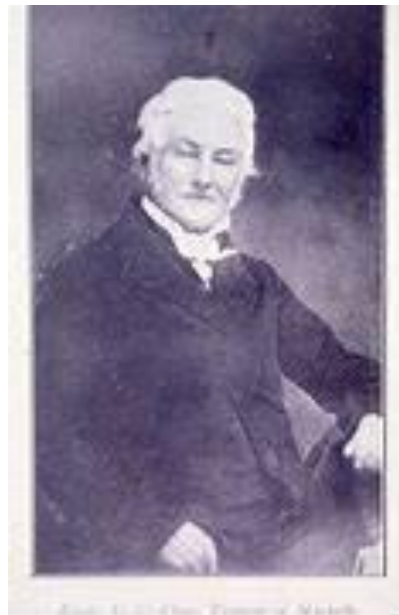
Figure 5: Edward Charles Close of Morpeth