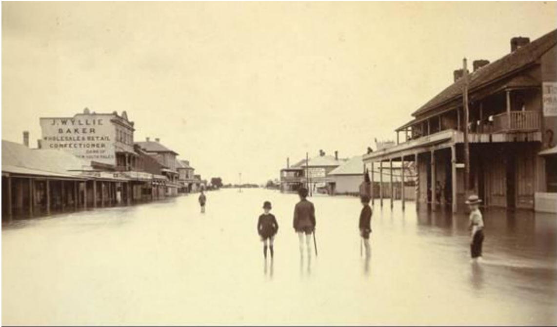
Figure 4: Floodwaters in Melbourne St, East Maitland, near the intersection with Newcastle Rd in 1893 (George Thomas Chambers). The depth of the water was considerably greater in 1955 than is shown in this photograph.